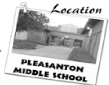
PLEASANTON MIDDLE SCHOOL